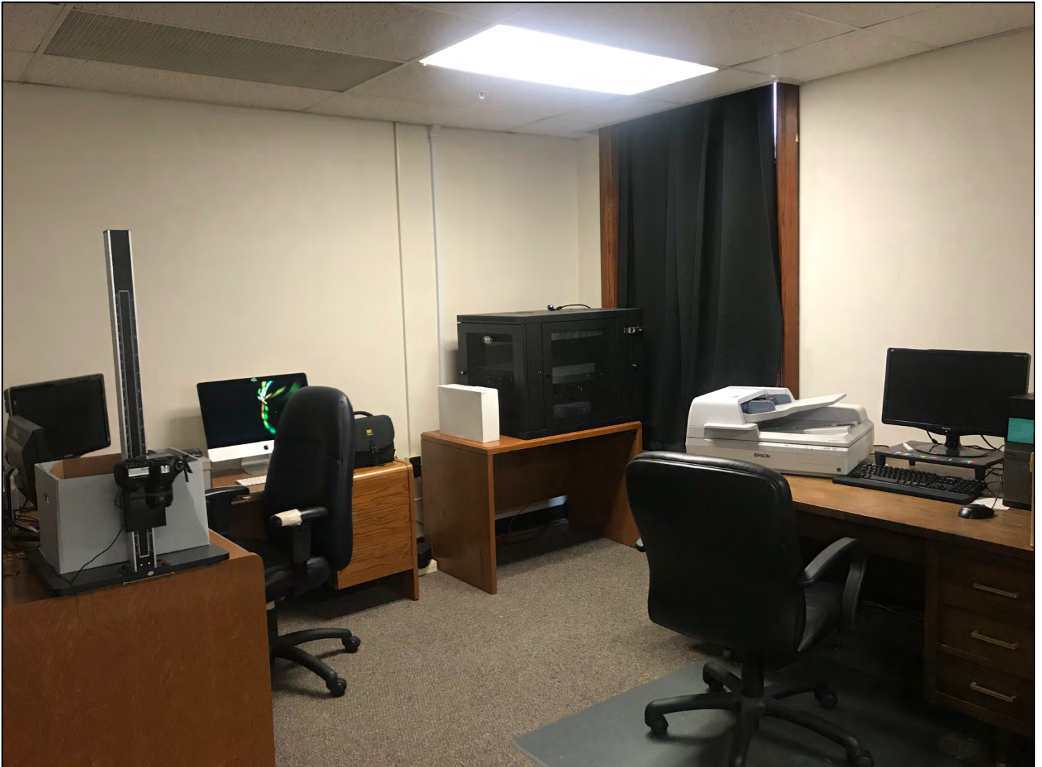
The center maintains an industry-standard born-digital processing area and digitization lab to photograph and scan archival objects