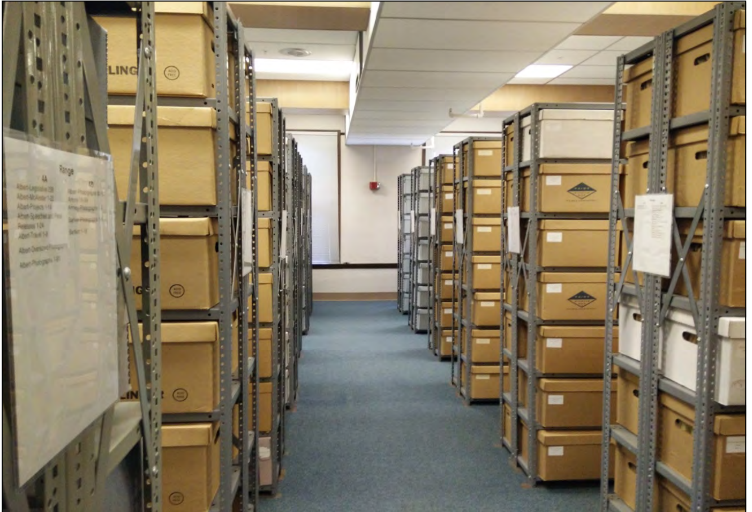
We house processed collections in a climate-controlled, secure environment at Monnet Hall and an offsite facility.