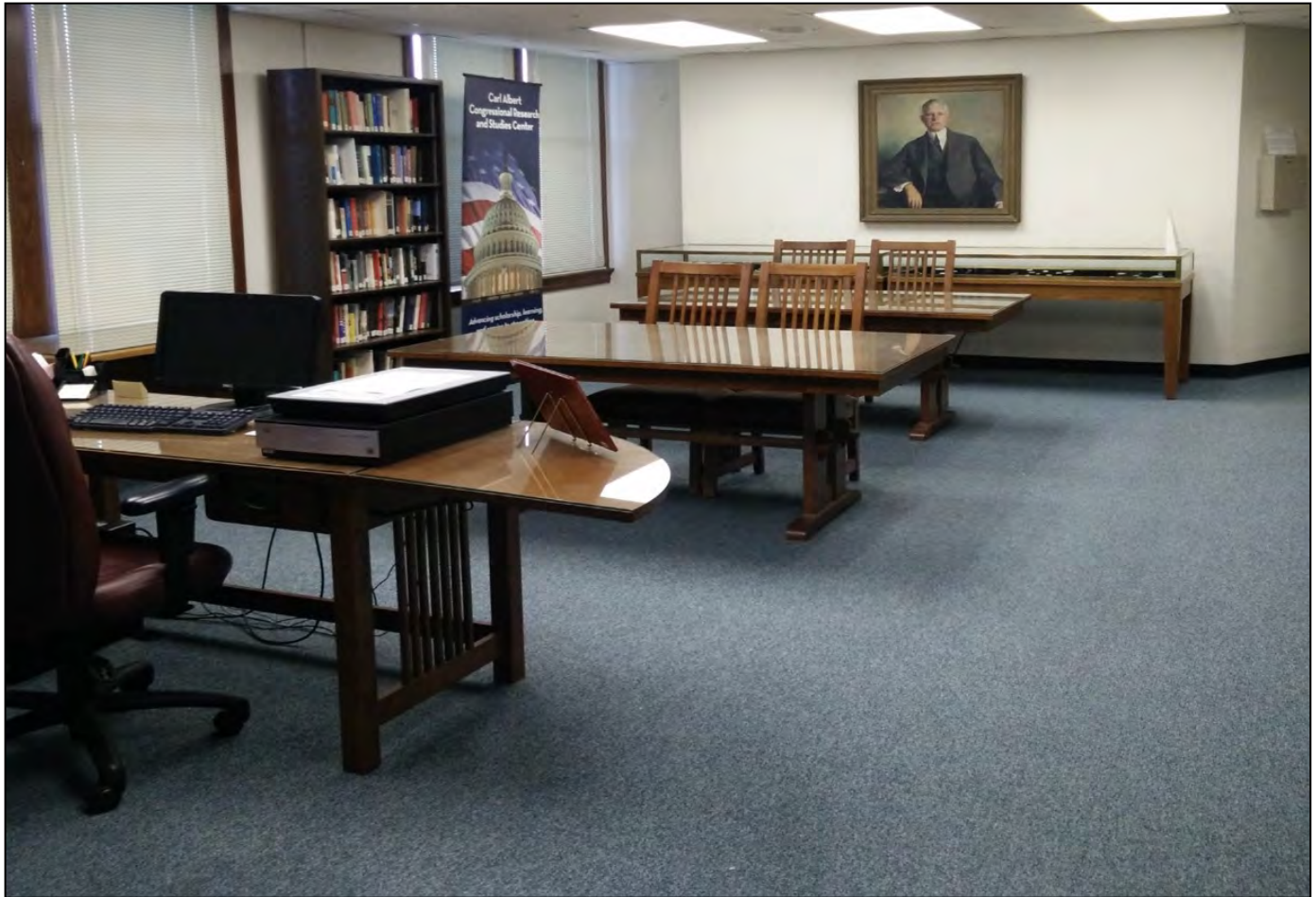
Researchers can access our collections in a monitored reading room.